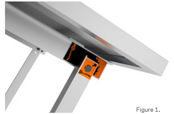
Labels are attached on the top bracket hinge points to help find the correct position.